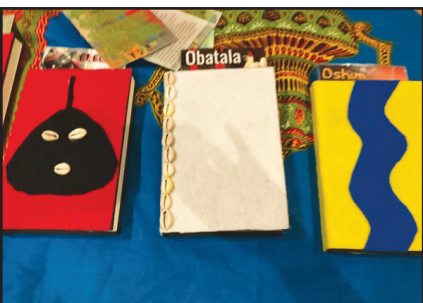
Iwe (journals) created by Ira, and used by project participants.